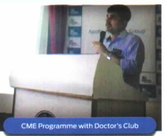
Apollo Medical Update 2019: February 2019